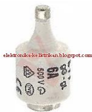
Figure 1. Physical Fuse.

This type of security has a wire of the silver type with a mixture of other metals such as lead, zinc & copper. The working principle is to disconnect the melting wire if there is an increase in current in the system beyond its nominal limit (Anderson et al., 2022). Figure 1 is a physical image of a fuse.