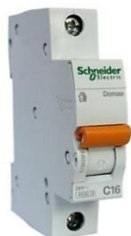
Figure 3. Physical MCB.

MCB is a safety circuit with a thermic component (bimetal) for overload protection and an electromagnetic relay for short-circuit protection. MCB is widely used for single-phase and three-phase circuit protection (Anderson et al., 2022). Figure 3 is a physical image of the MCB.