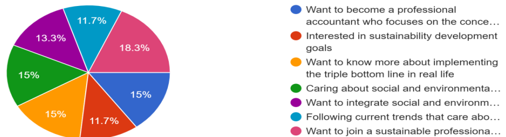
Figure 3. Perspective of Student Expectations After Following Sustainability Accounting Material