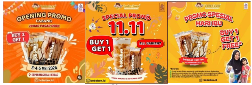
Picture 4. Promo available at Bobabox

"The promo issued by bobabox for me is very interesting and profitable, promos such as buy 2 get 1 make me to buy it immediately. With this promo, I can buy 2 of my favorite boba and get 1 free boba with different flavors. So I can save a lot and enjoy boba with my friends" (Interview Result on May 20, 2024)