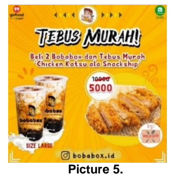
Cheap Redemption Promo Collaboration with Snackship

Based on interviews and observations of sales promotion content uploaded to the @bobabox.id Instagram account, researchers argue that the promotional strategy implemented is successful, because promotional content varies greatly in response to ongoing momentum, so that promotions are not monotonous. In addition, collaborating with other brands provides additional information to Instagram users about bobabox.