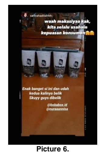
Bobabox Reposts Its Customers' Instagram Story Posts

In this public relations and publicity section, the role of the Bobabox Instagram admin and contacts connected to the link on bio is needed to build a positive image of Bobabox. From the results of the interview, it is known that the Bobabox Instagram admin uses a question and answer system, criticism and suggestions through the media provided. Bobabox Instagram admin always maintains relationships with its consumers by accepting criticism from consumers, such as if the bobabox drink is less sweet, bobabox Instagram admin creates customer satisfaction is bobabox's top priority. In addition, the bobabox Instagram feeds and Instagram stories, by reposting uploads that have been uploaded by consumers first. This helps establish good communication and relationships with customers or followers on Instagram.