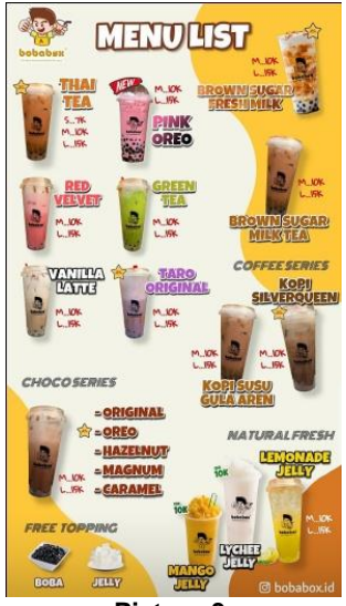
Picture 3. List of Existing Menus at Bobabox

"We offer superior products when compared to competitors' products, our quality is better in terms of taste and prices are also economical. In the bobabox for only Rp. 10,000, we offer the same taste as the price of Rp. 30,000." (Interview Result on May 10, 2024)